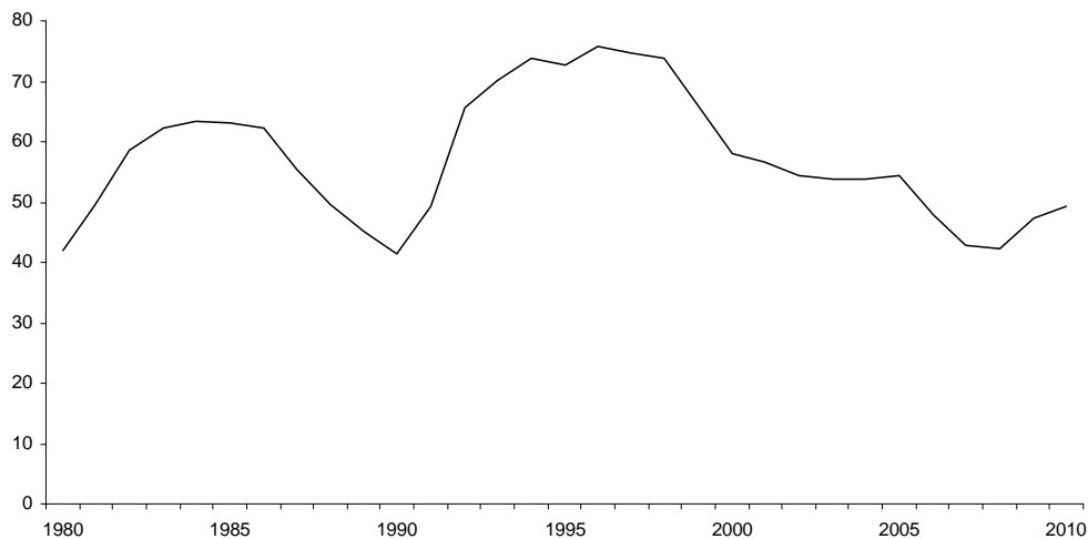
Figure 2. Gross general government debt in Sweden, per cent of GDP